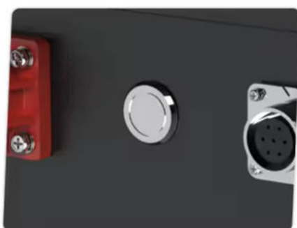
Intelligent one-button control ON/OFF