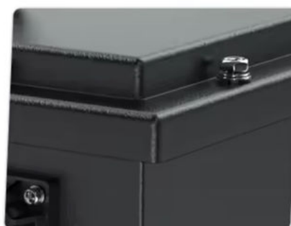
Metal material is more sturdy