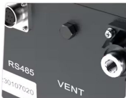
Help to vent internal gases