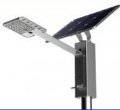
Solar Street Light