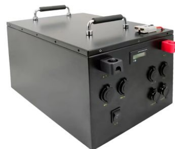
Energy storage lithium battery